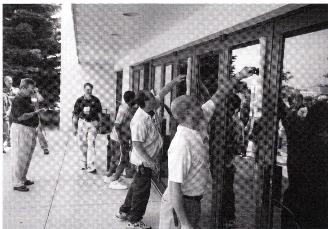
The Olympia Resort hotel was left with cleaner windows after the lunchtime window cleaning contest took place.